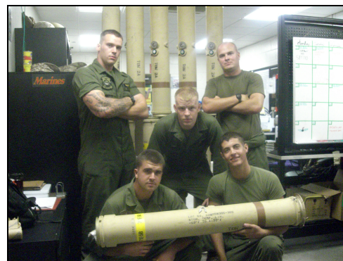
Ordnance Marines proudly stand with TOW missile casings after 10 effective launches.

Over the past two months, Tiger Ordnance Marines rose to numerous challenges, directly leading to 10 successful TOW shots, over 500 rockets, and thousands of rounds fired on local area ranges. These TOW shots represented the first on Okinawa in over a year. Tiger Cobras reported no TOW capable aircraft in June, and now have 4 following a month of noteworthy efforts. They have dedicated countless 18-hour days and several weekends in the pursuit of this achievement. Under the leadership of Capt Keene and GySgt Ivey, the "IYAOYAS" of