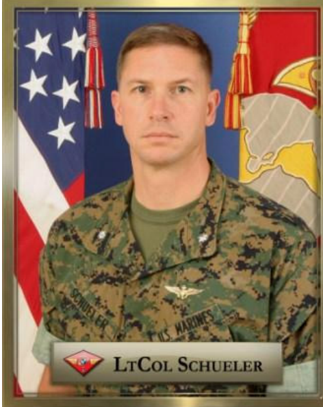
A Message From the Commanding Officer:

http://www.1maw.usmc.mil/index.asp?unit='HMM-262'