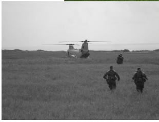
Det 18 Marines working hard to support operations