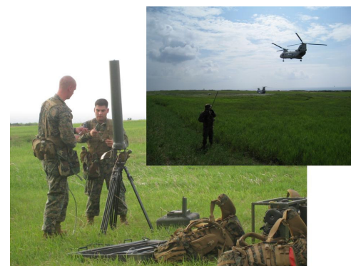
Det 18 Marines set up navigation antennas

The Tiger's Air Control Group Detachment stayed busy since joining the squadron. Formed from Marines based in both Okinawa and Iwakuni, the MACG Det gelled quickly. In August the MACG Det rode to Ie Shima Island with HMM 262 (REIN) for an initial test of combat effectiveness, we participated as the ACE representative in the MEU communication exercises, and coordinated a joint exercise with USAF Special Ops aircraft and HMM 262 (REIN).