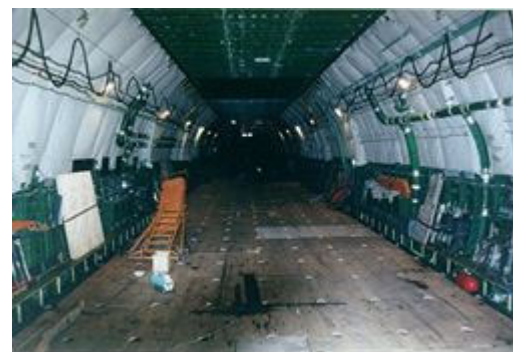
Interior view of the Russian AN-124 Condor