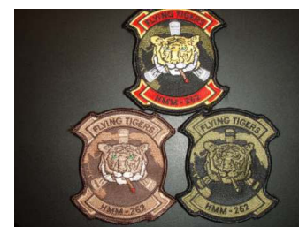
Patches - $5 each