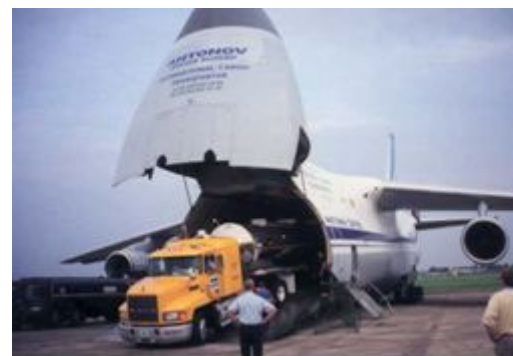
A tractor-trailer drives out of the nose of a Russian AN-124 Condor