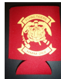
Can Coozie - $2 each