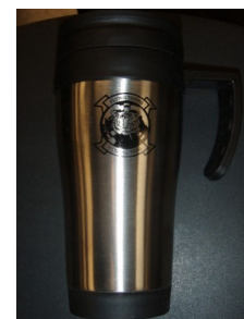
Travel Mugs - $10