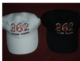
Hats - $10