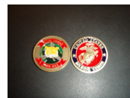
Coins - $5