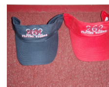
Visors - $10